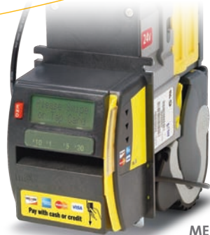
MEI CASHFLOW 3-in-1 bezel for recyclers