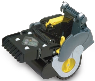
MEI CASHFLOW ® VNR Vending Recycler

High-Visibility Bezel option strokes through a wide range of colors