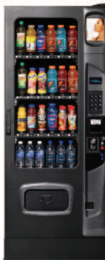
ENERGY STAR Configuration

Shown with silver ADA door and optional kick panel options.