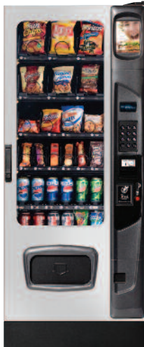
*Non-ENERGY STAR Configuration

Shown with silver ADA door and optional kick panel options.